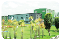
PRODUCTION FACILITY COIMBATORE, TAMILNADU, INDIA