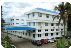
PRODUCTION FACILITY EDAYAR, ERNAKULAM, INDIA