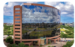
SALES OFFICE TEXAS, USA