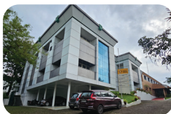
ARJUNA INNOVATION CENTRE KEEZHMAD, ERNAKULAM, INDIA