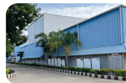
PRODUCTION FACILITY PERUNDURAI ERODE, TAMILNADU, INDIA

Bettering lives across the globe through Innovative Natural Solutions.