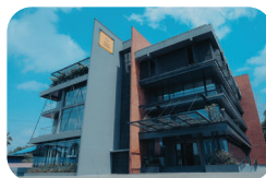
CORPORATE OFFICE ALWAYE, ERNAKULAM, INDIA