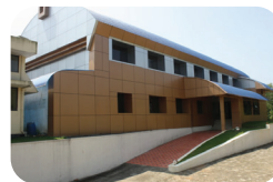
LIVLONG NUTRACEUTICALS LTD